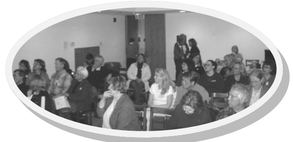
Focus Meeting participants, Sunday, January 30, 2011